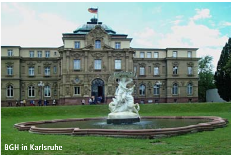
BGH in Karlsruhe

A joint-stock company need not inform its shareholders in writing of the exclusion of shareholder rights and the reasons for it before carrying out a capital increase with authorized capital, the Federal Court of Justice (BGH) has ruled. On the so-called authorized capital the board receives capital-increase discretion by AGM resolution. However, shareholders could still have the board's actions reviewed retrospectively in a declaratory action, the BGH found. A declaratory judgment can be the basis for later claims for damages, and justify AGM refusal of discharge to the board.