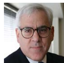
David Rubenstein, co-founder and Managing Director of private equity firm Carlyle, sees Germany as currently the most

exciting place for buyouts (takeovers) in Europe. In Germany there are in his view many companies that could be improved. Says Rubenstein: "Germany can profit more from private equity than any other country on the continent, if not in the whole world." Carlyle is concentrating its investment policy particularly on large German companies. Negotiating with small and medium-sized businesses is 'like waiting for Godot'. Promises to sell, for instance, are often not kept, thinks Rubenstein. It is, moreover, hard to buy listed companies, because a private equity firm has to persuade the board not to engage in an auction with other bidders.